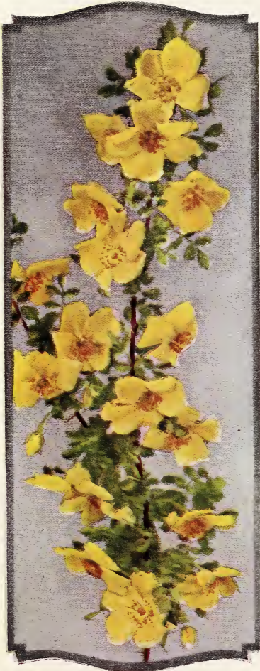
Hugonis—New Chinese Pillar Rose. Price, $1.75 each, $16.00 per 10.